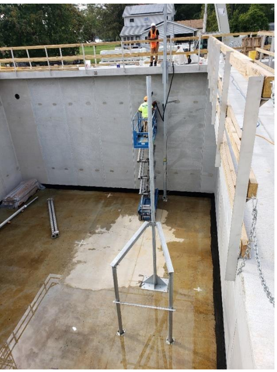
New Waste Water Treatment Plant