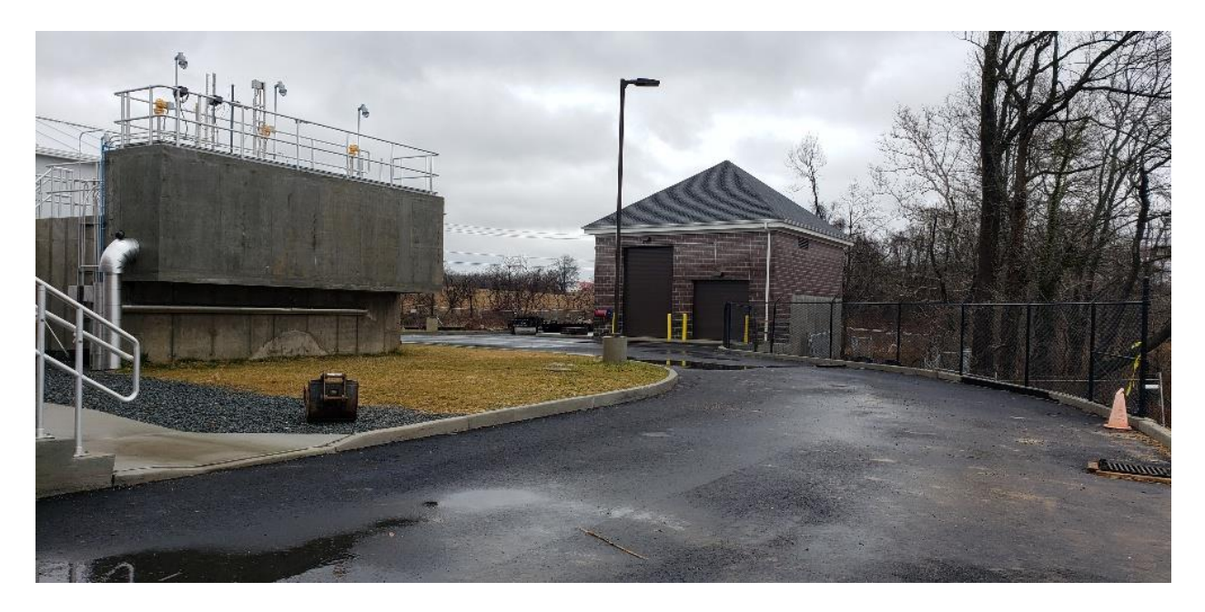
SECTION F Photographs of projects