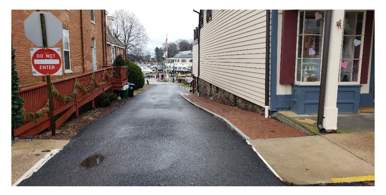
First Steet (East) – New brick sidewalk with granite curbing, and paving