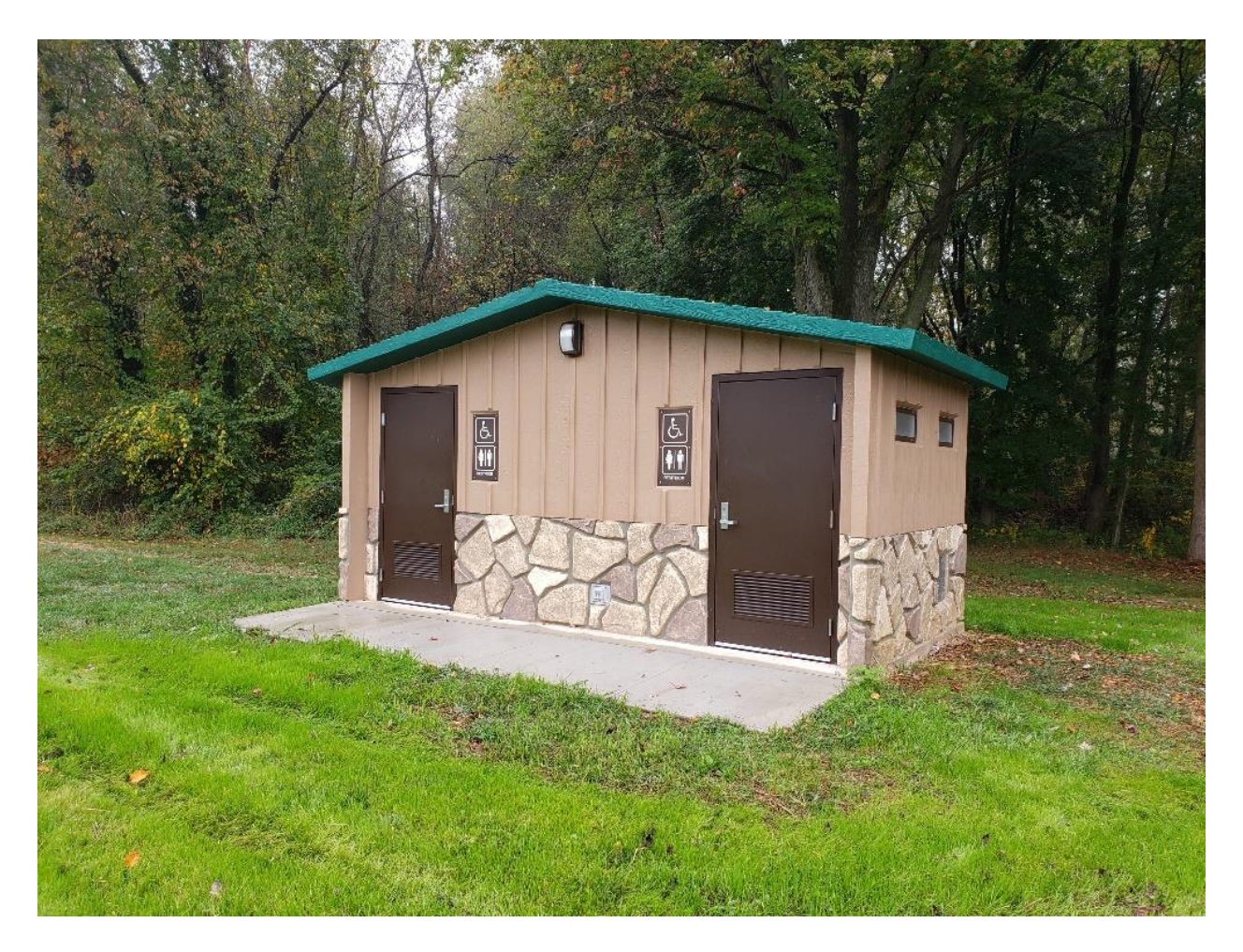
Restroom for Helen Titter Park